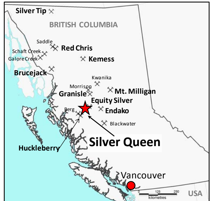
Figure 1 - Location of Silver Queen Property and Major Deposits