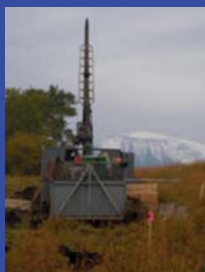
2011 Drilling on the Silver Queen Property