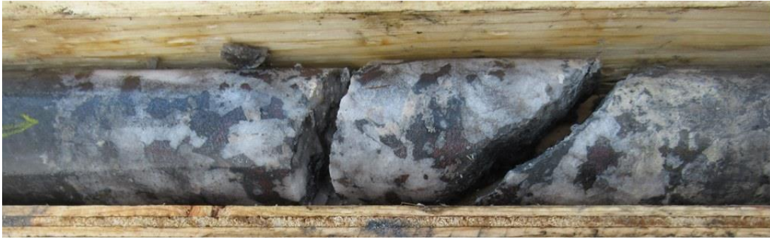
Figure 1: Quartz-barite vein with “Ruby Silver” mineralization, from ~112.8m to 113.1m in hole SQ20-010, Camp Vein target, Silver Queen property